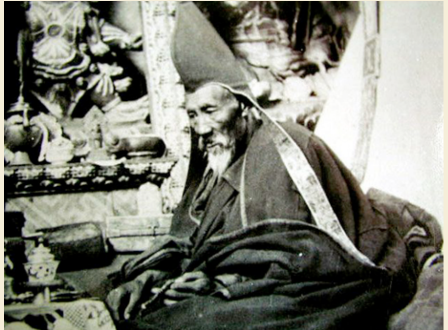
The First Shangpa Rinpoche

The result of Ignorance: One is born in the Animal realm and experiences the torture suffered by animals.